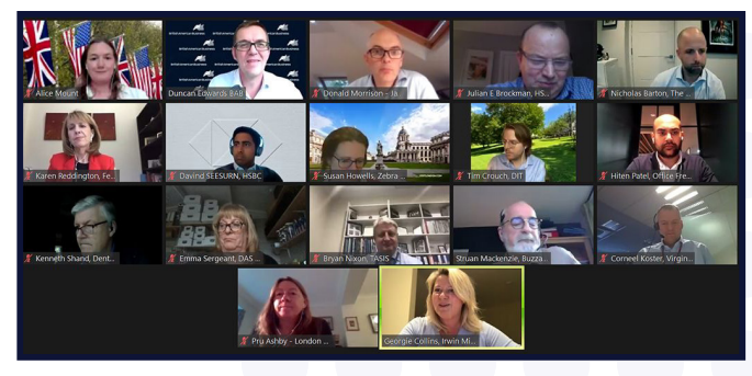
TAG Masterclass Roundtables Sponsored By: HSBC

Sponsored By: Capalino, JobsOhio, Marks Paneth, Willis Towers Watson