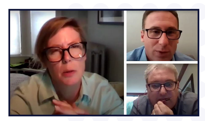
Infrastructure Investment: Paving the Way Towards Economic Recovery Sponsored By: Turner & Townsend