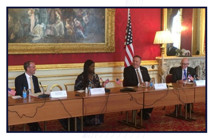
Roundtable with US Secretary of State Mike Pompeo and UK Secretary of State for Foreign and Commonwealth Affairs The Rt Hon Dominic Raab MP