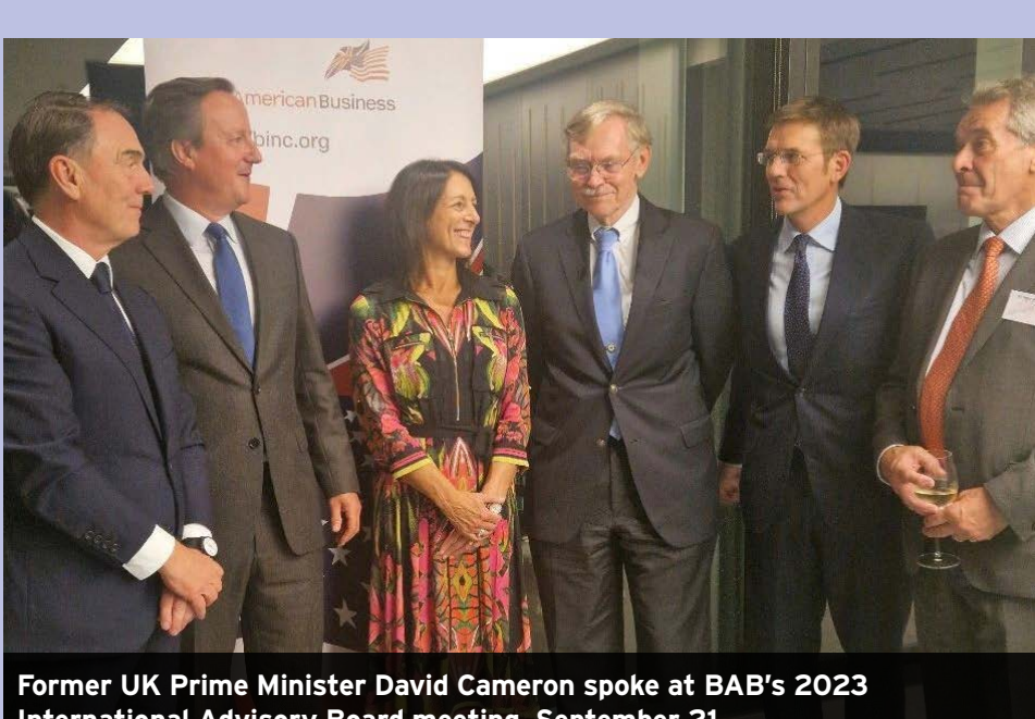
International Advisory Board meeting, September 21.