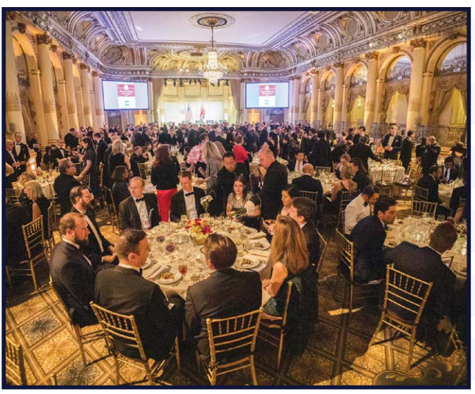
Transatlantic Business Awards Dinner 2023