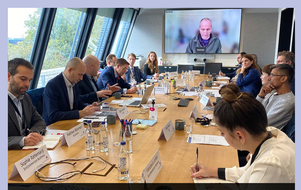
BAB Policy Digital Economy Sub-Committee Debrief on AI Summit and Presentation of BAB's Policy Paper 'Advancing the Global AI Discourse', hosted by Palantir in London, November 3, 2023.

At a political level, our 2023/24 Policy Agenda received notable government endorsement in both Washington DC and in London. BAB has engaged business and government in the production of comprehensive policy papers, focused on a range of critical issues